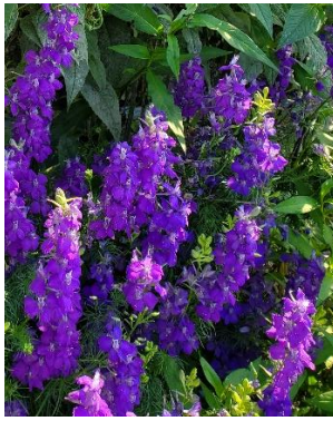
Larkspur (May – Jun)