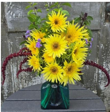
Munchkin Sunflowers & Basil