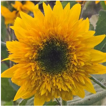
Teddy Bear Sunflower