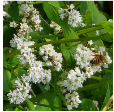
Buckwheat (June -Oct)