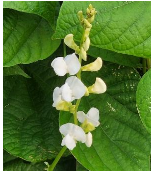
Hyacinth Bean (Jul – Sep)