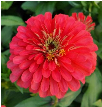
Benary Zinnia ( Jul – Oct)