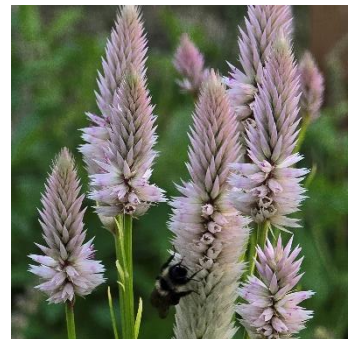
Celosia (Jul – Oct)