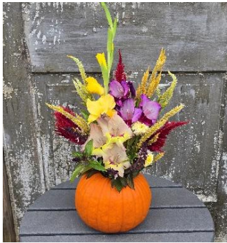
Pumpkin Vase Bouquet