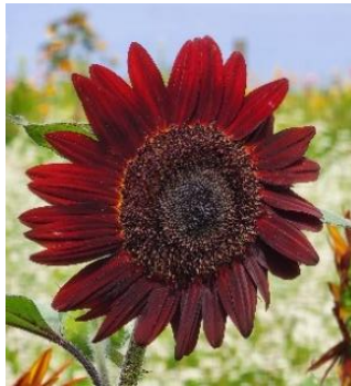
ProCut Red Sunflower