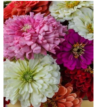
Mixed Benary Zinnias ( Jul – Oct)