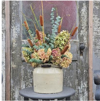
Hydrangea, Eucalyptus, Cattails