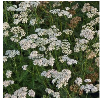
Yarrow (May – Sept)