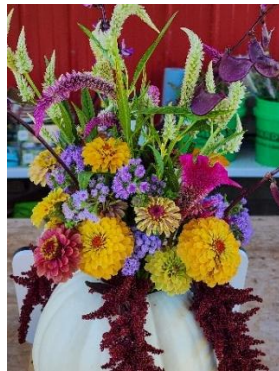
White Pumpkin Vase