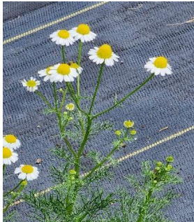
Chamomile (May – June)