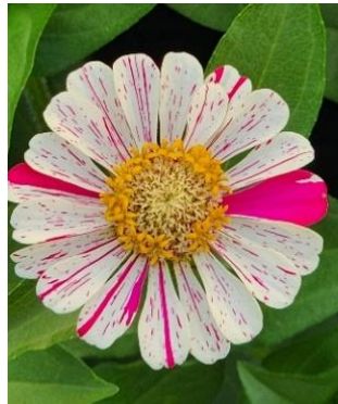
Peppermint Zinnia ( Jul – Oct)