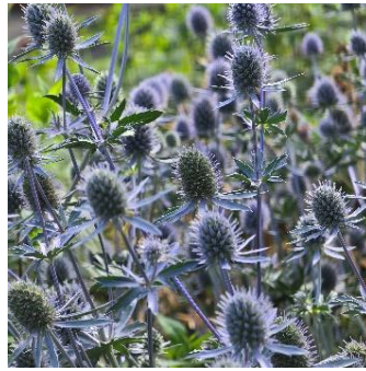
Sea Holly (May – Jul)