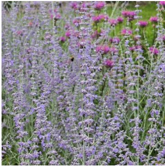
Russian Sage (Jun – Oct)