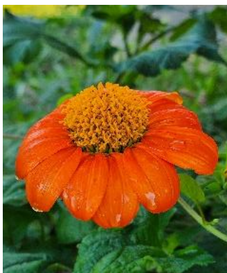
Mexican Sunflower (Sep – Oct)