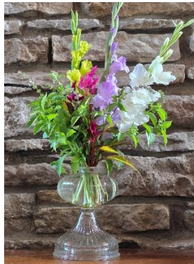
Custom Oil Lamp Vase