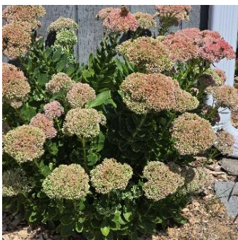
Stone Crop (Aug – Oct)