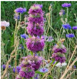
Horse Mint (May – Sept)