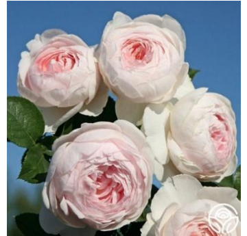
Parfuma Earth Angel