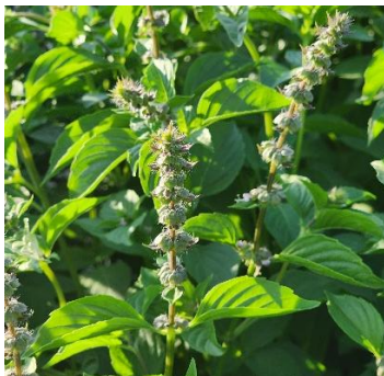
Lemon Basil (Jul – Oct)