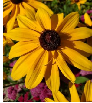
Black Eyed Susan (May – Sep)