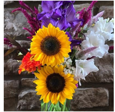
Sunflowers, Gladiolus, Celosia