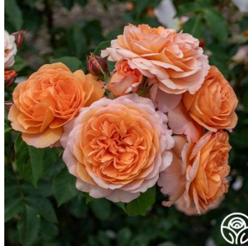
Louise Clements Shrub