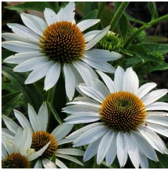
Cone Flowers (May – Jul)