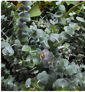
Eucalyptus (Jul – Oct)