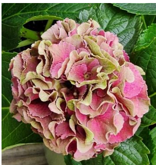
Hydrangeas (May – Aug)