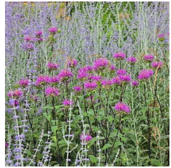
Bee Balm (May – Jun)