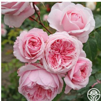
Arborose Kiss Me Kate