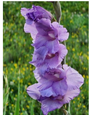
Gladiolus (Jun – Oct)