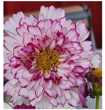
Cosmos (Jul – Oct)