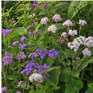
Ageratum (June – Oct)