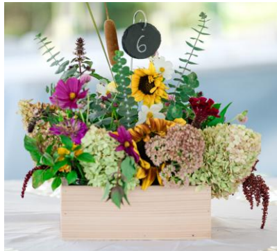
Cedar Box Table